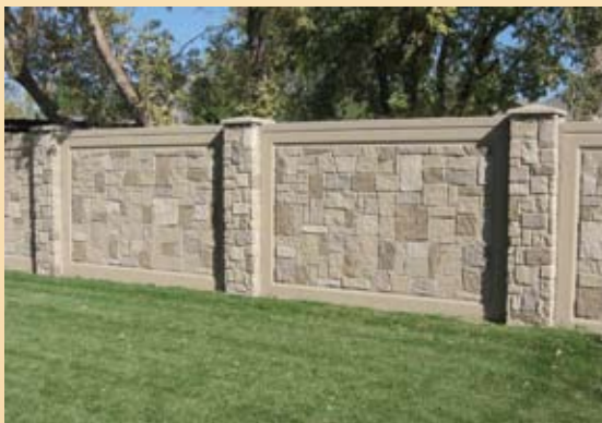
TOP: COBBLE BOTTOM: DRY STACK